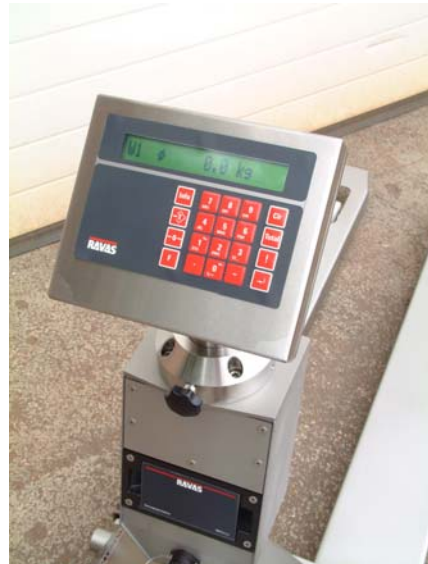
Rotating indicator with alphanumerical keyboard and display