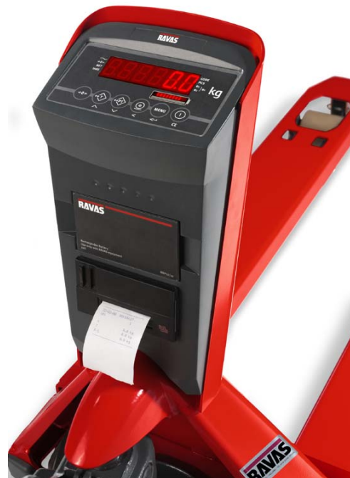
Options: integrated printer