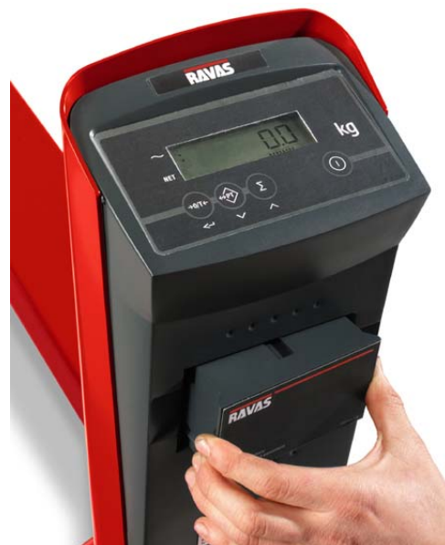
Exchangeable battery module