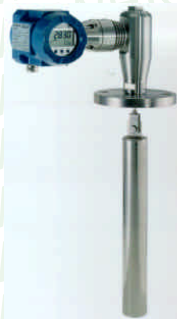
Model ILWT with integral transmitter